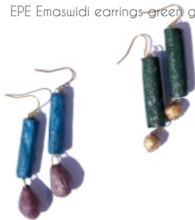
EPE Emaswidi earrings green gold