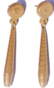
CCGE Coil drop gold earring