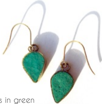
PPE Petal earrings in green