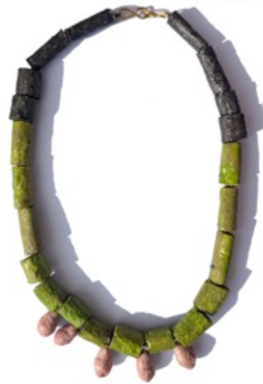
EPN Emaswidi necklace pink drop