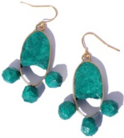
TBE Trinary earrings in emerald