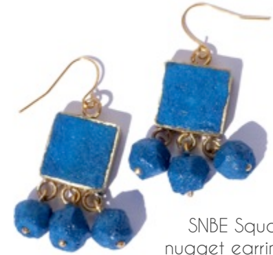
SNBE Square nugget earrings in blue