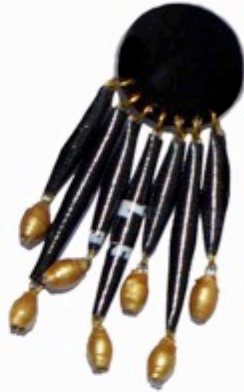
CBE Candelabra earrings black