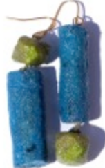
EPE Emaswidi earrings azure