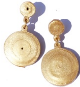
CMGE Coil medium gold earring