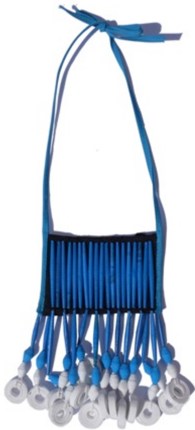
ICN Indlamu coil necklace