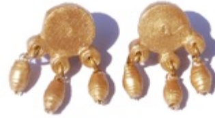
CBGE Coil bead gold earring