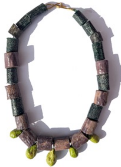
EPN Emaswidi necklace pear drop