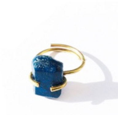
NPR Nugget ring in blue