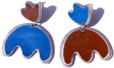
NSE Nosisa earring

Bringing paper back to its original source as wood. These pieces are handmade from layers of paper, sculpted, cut, sanded and varnished. The colour comes from the pages of the magazine.