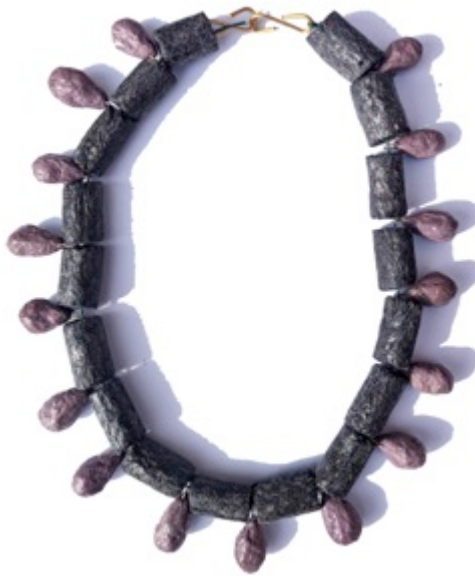
EPN Emaswidi necklace lilac drop