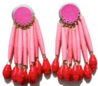
SBE Swazi earring