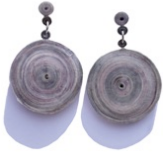
CLE Coil large earring