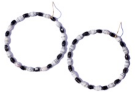
CHE Charm hoop earring