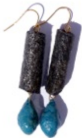
EPE Emaswidi earrings azure drop