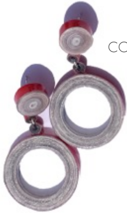
COE Coil circle earring