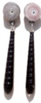
CDCE Coil drop earring