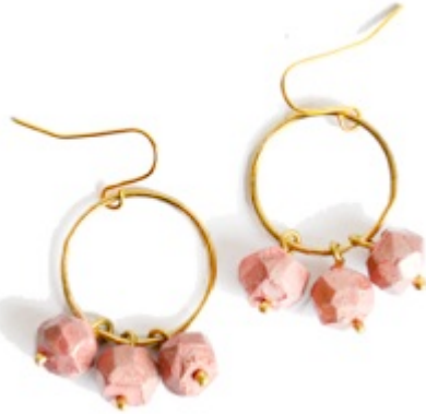
TNE triple nugget earrings in pink