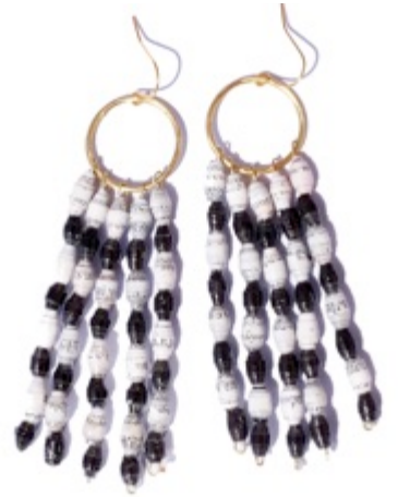
CLE Circle charm drop earring