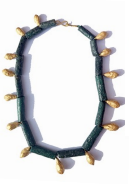
EPN Emaswidi necklace gold drop