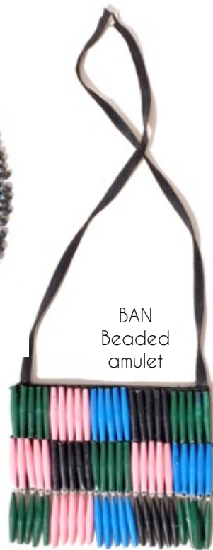
BAN Beaded amulet