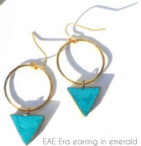
EAE Era earring in emerald