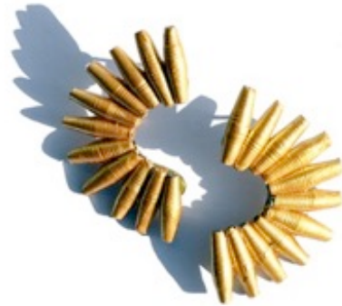
FGE fan gold