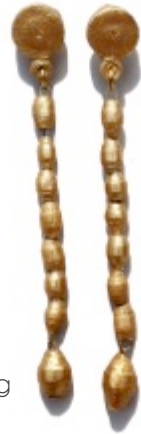
CCGE Coil charm gold earring