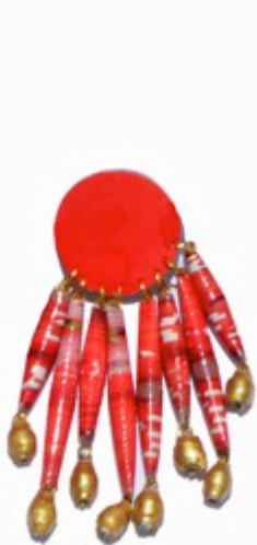
CBE Candelabra earrings red