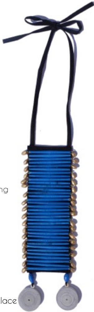
IBN Indlamu beaded necklace