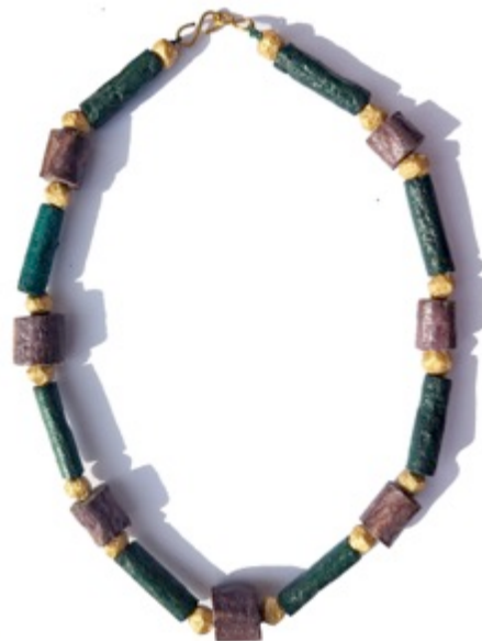
EPN Emaswidi pulp necklace green lilac