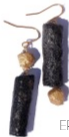
EPE Emaswidi earrings charcoal