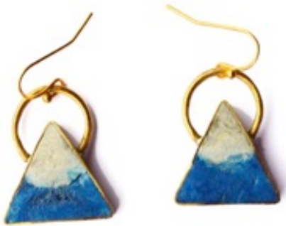
PTTE Triangle two tone earring