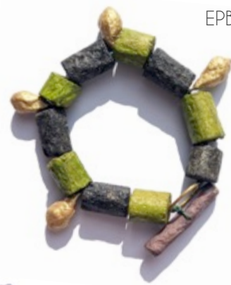
EPB Emaswidi bracelet