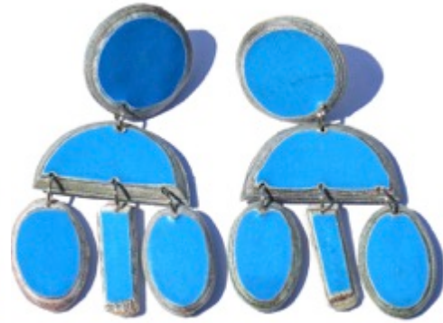
NLE Nesta Layered earring