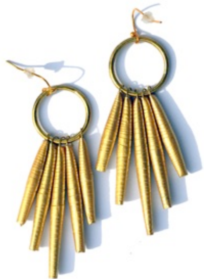
CPG drop earring gold