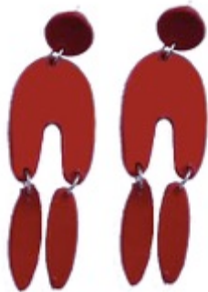
OKLE Omi earring in red