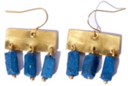
LNBE Long nugget earrings in blue