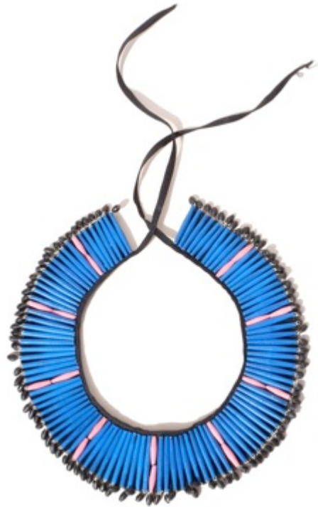
BCN Beaded circle necklace