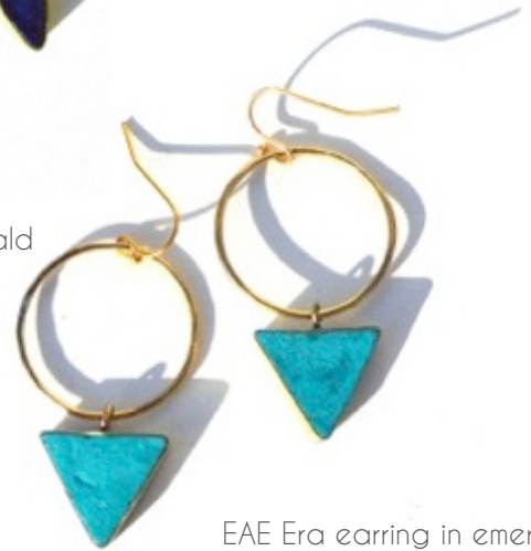
EAE Era earring in emerald