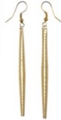
BGE bead full gold