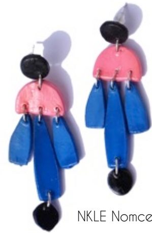
NKLE Nomcebo earring