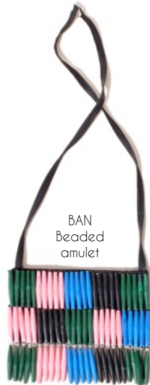
BAN Beaded amulet