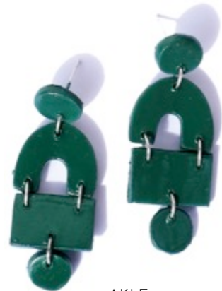
AKLE Aviwe earring green