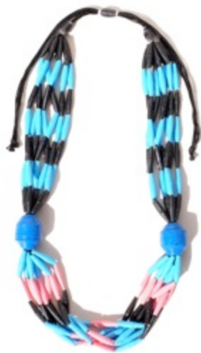
LBN Lokwa necklace 2