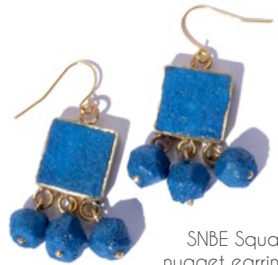
SNBE Square nugget earrings in blue