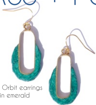
OBE Orbit earrings in emerald