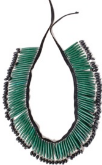
SBN Swazi beaded necklace green black