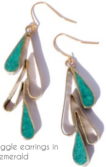
SBE Squiggle earrings in emerald