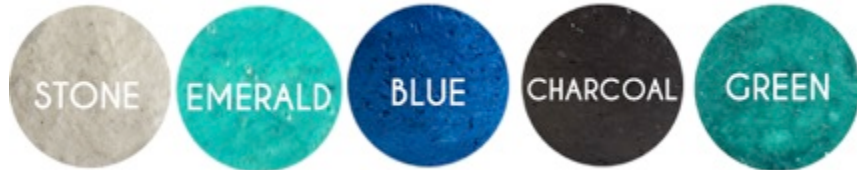
A - COLOUR CHART FOR PULP PRODUCTS

All designs and products are original artistic design of Quazi Design and as such may not be copied in any form whatsoever.