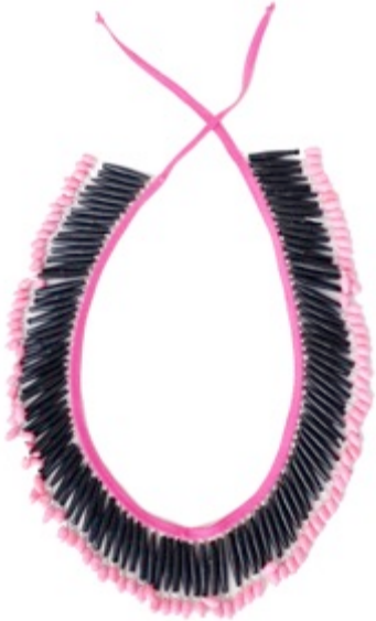
SBN Swazi beaded necklace black pink