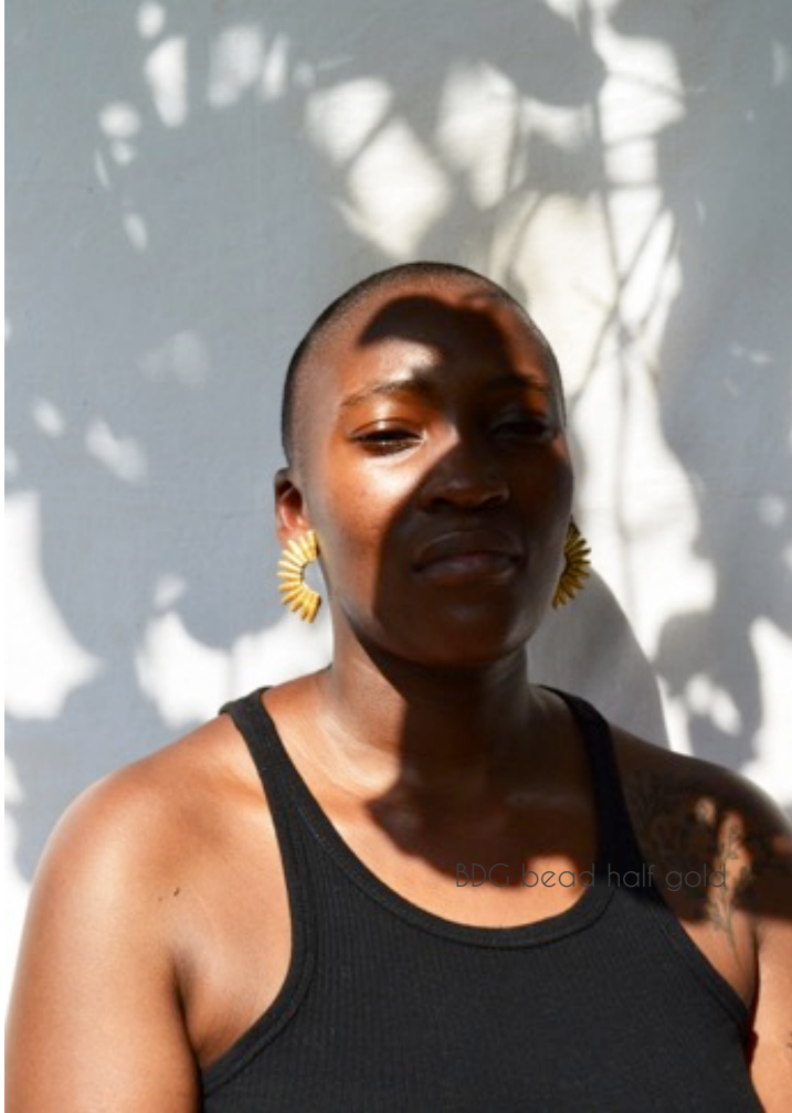
BDC bead half gold