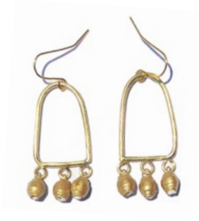
BWE Bongiwe gold earring