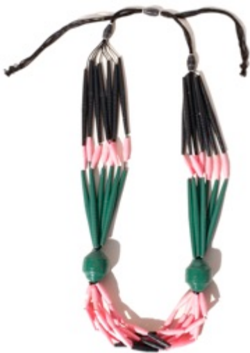
LBN Lokwa necklace 1