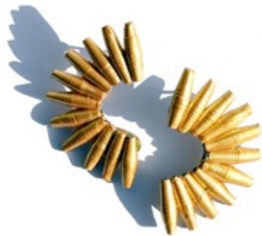
FGE fan gold