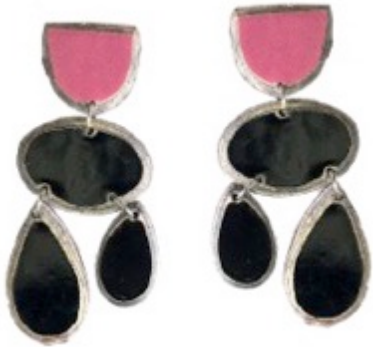
BLE Bonga earring