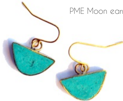
PME Moon earring in emerald