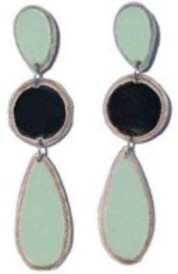
IVE Imvula earring