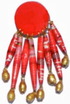
CBE Candelabra earrings red