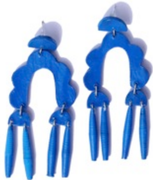
LKLE Lwande earring blue