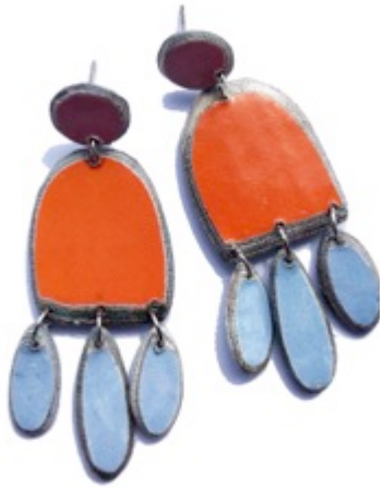
IFE lifu earring