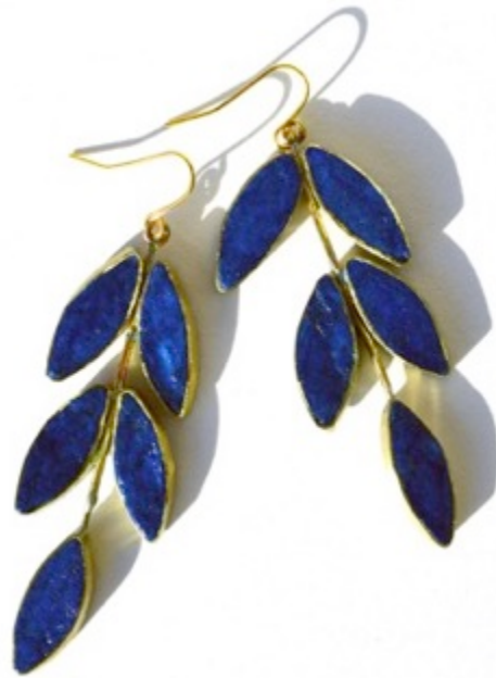
PYE posy earrings in blue