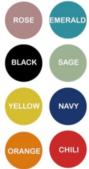
B - COLOUR CHART FOR LAYERED PRODUCTS