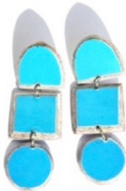
LLE Lindiwe layered earring