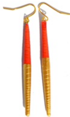
BDC bead full gold