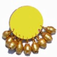
CBE Gazania earrings in yellow