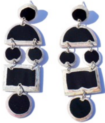
NKE Nokuthula earring