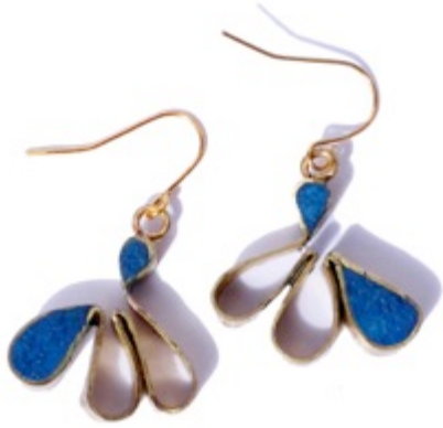
QBE Quiver earrings in blue