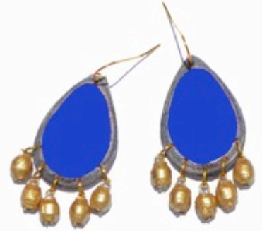
ABE Aloe earrings in blue