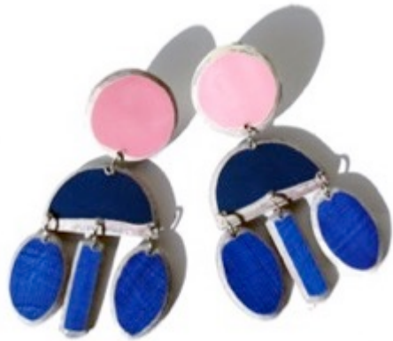
NLE Nesta earring custom colour