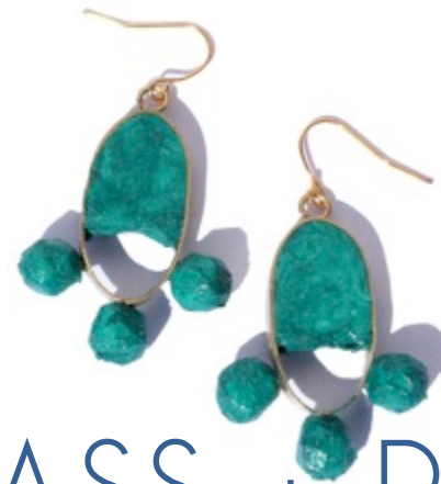
TBE Tertiary earrings in emerald