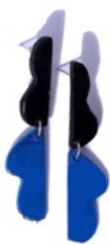
TKLE Tana earring