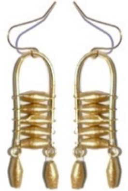
AWG Ayanda gold earring