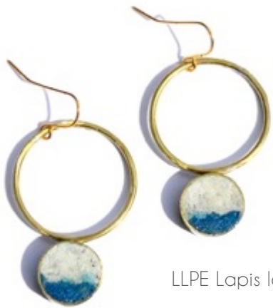
LLPE Lapis lazuli earring