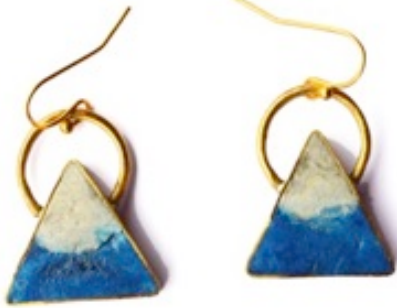
PTTE Triangle two tone earring