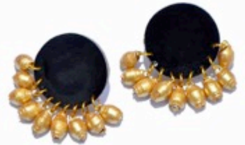
CBE Gazania earrings in black